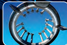
Upper Steam Ring