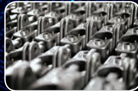
Oil Gun Parts