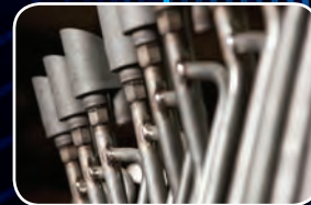
Flare Parts & Ignition Systems