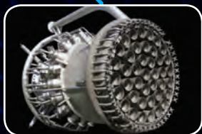
Replacement Flare Tips