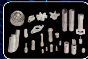
PARTS & SERVICE

COMBUSTION AND ENVIRONMENTAL SOLUTIONS. PURE AND SIMPLE.®